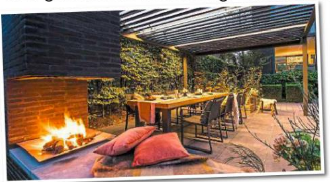
High life: Roof gardens have become ever more popular during the pandemic